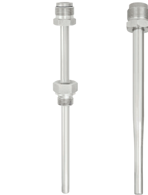
Fig. left: Threaded protection tube, design TW35-4 (form 2G) Fig. right: Push-in/weld-in protection tube, design TW35-3 (form 3)

Based on the almost limitless application possibilities, there are a large number of variants, such as thermowell designs or materials. The type of process connection and the basic method of manufacture are important design differentiation criteria. A basic differentiation can be made between threaded and weld-in thermowells/protection tubes, and those with flange connections.