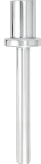
Thermowell for lap flanges, model TW30